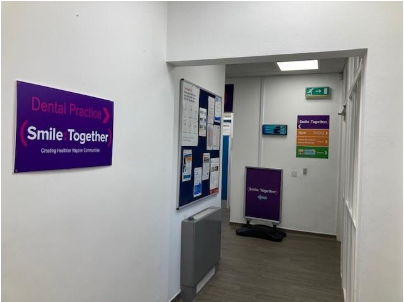
The foyer is well lit with adequate lighting. The floor is carpeted. The hallway leads to a further internal door which is the access into the Dental Practice.